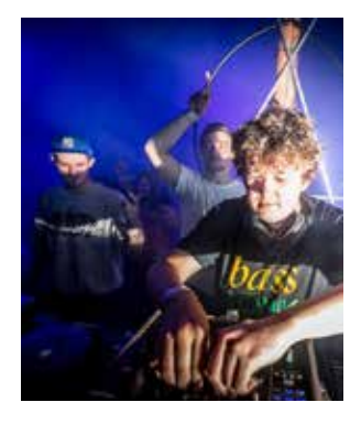
Unity Sessions + KSK

We will have prizes for the best costumes, and for the biggest guiff!