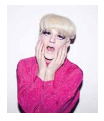
Help! I Think I Might Be Fabulous Alfie Ordinary Old Fire Station Tue 22nd: 6.00pm