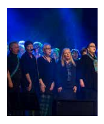
Dumfries Community Choir