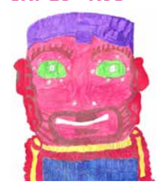
King Arthur Prism Arts Carlisle Cathedral Sat 26th: 11.30am