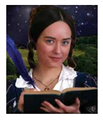
Pride & Prejudice

Join us in the 301 miles Bar as the monthly Open Mic Night express rolls up to platform 4. Join us between 5pm until 8:30pm as Cumbria's emerging and local talent take the stage...all aboard the hype train.