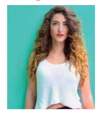
You Can't Polish A Turd Kelly Convey Old Fire Station Sat 19th: 8.00pm