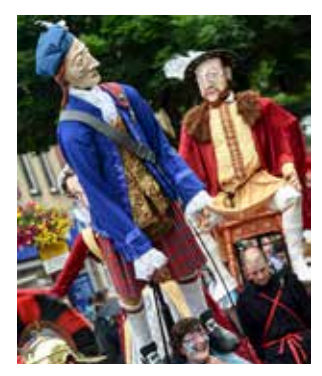
The Great Fair Proclamation Market Cross Sat 26th: 10.00am

Performed by Prism Arts Youth Theatre. Come and help the magnificent King Arthur battle to save the land in a story we will tell for generations to come.