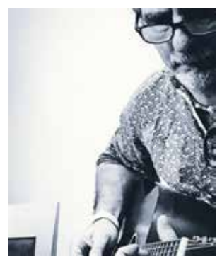
Patchwork Opera 301 Miles from London Sun 27th: 11am - 6pm Words